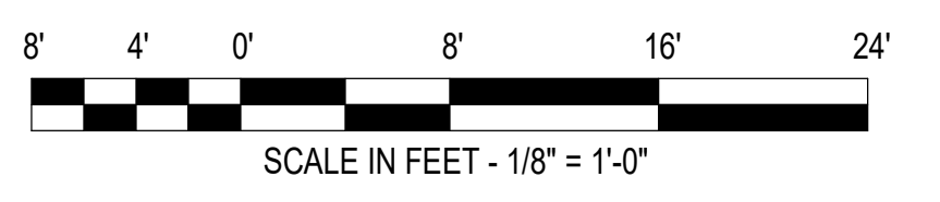
4 WEST ELEVATION A002 1/8" = 1'-0"