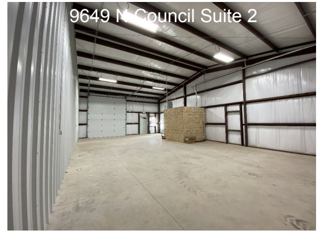
9649 N Council Suite 2