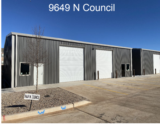
9649 N Council