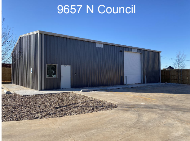
9657 N Council