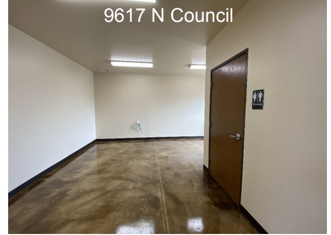
9617 N Council