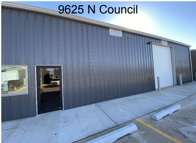
9625 N Council