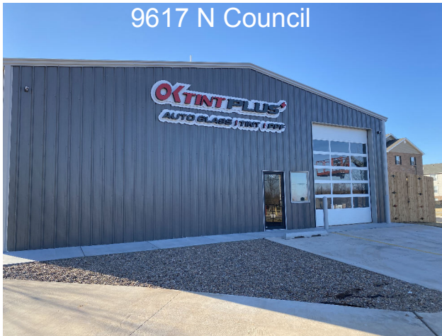
9617 N Council